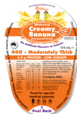
Level 400 Moderately Thick