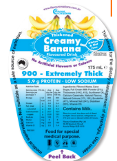
Level 900 Extremely Thick