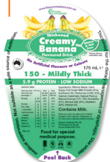
Level 150 Mildly Thick